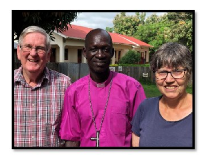
With Bishop Marandulu Levi, ECSS Bishop of Yei

N.B. Week 1 of the 2025 Discipleship training starts on 27th January for 100 young people. Do please pray.