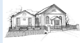
King's Somborne Methodist Church