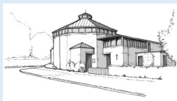
Wesley Methodist Church Weeke