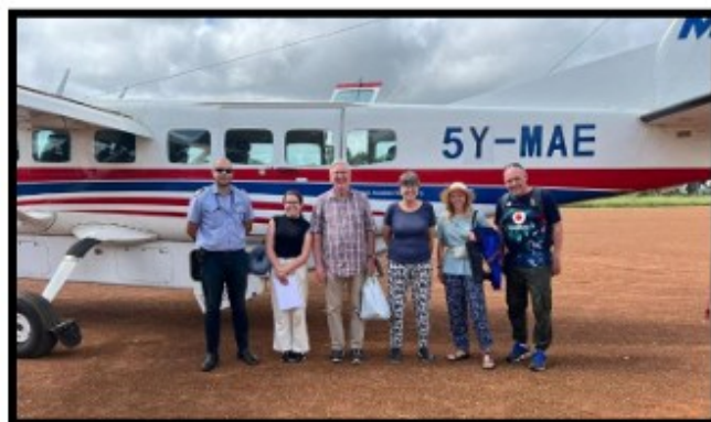
At Yei airstrip, before boarding the MAF plane